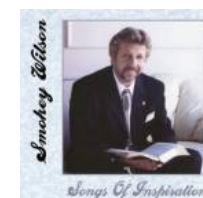
Songs Of Inspiration